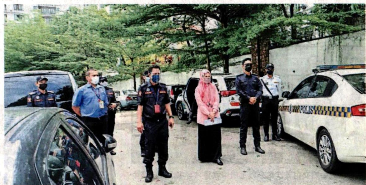
■ 联合取缔行动。 梳邦再也市政厅和警察针对非法泊车，采取

(吉隆坡23日讯)非法泊车，妨碍交通，梳邦再也市政厅和警察采取联合取缔行动，合共开出112张罚单！