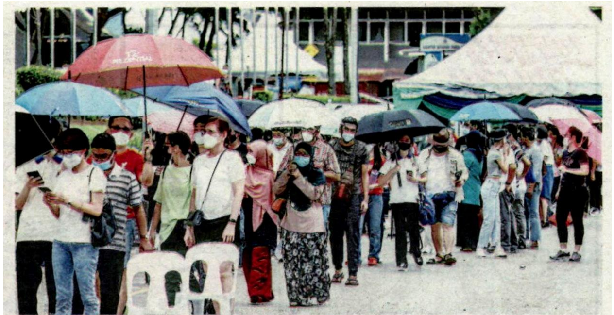
PENERIMA vaksin Covid-19 terdiri daripada pelajar sekolah yang ditemani ibu bapa dan penjaga beratur ketika menunggu giliran pendaftaran di Pusat Pemberian Vaksin (PPV) Dewan Sivik Majlis Bandaraya Petaling Jaya (MBPJ), Selangor semalam.