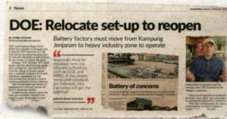
StarMetro's report on Feb 5.

StarMetro reported early this year that another company had bought over the facility with plans